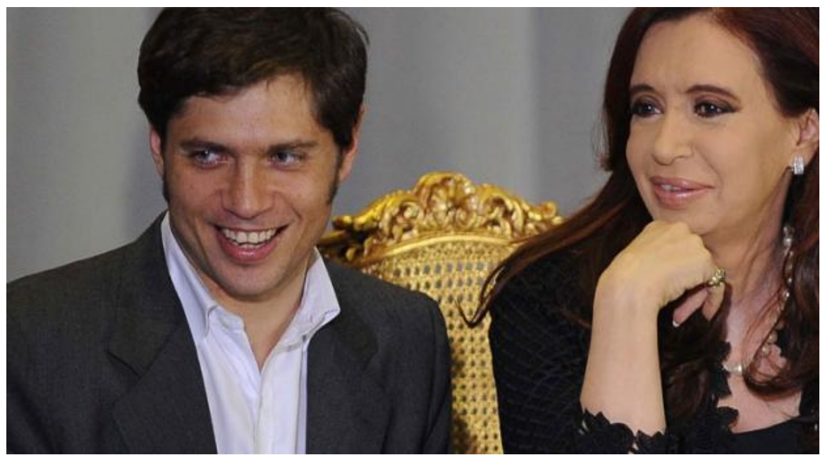
Figure 4: Axel Kicillof, architect of Argentina's economic policies, with President Cristina Fernández de Kirchner

The young, photogenic Kicillof is Fernández de Kirchner's main political adviser and the chief architect of the 2012 expropriation the holdings of the Spanish oil company Repsol. In defending the action, Kicillof mocked the concept of the "rule of law," saying the concept only served to protect big businesses.