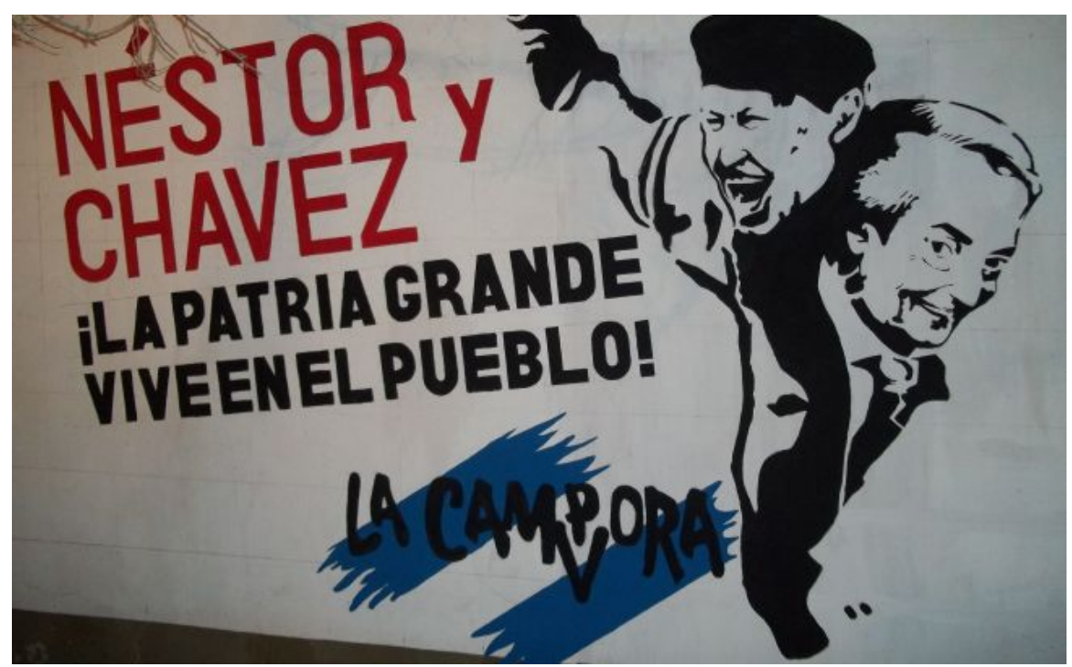
Figure 5: La Cámpora graffiti of Néstor Kirchner and Hugo Chávez