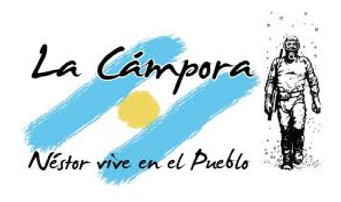
Figure 8: The cartoon hero Eternauta with the face of Néstor Kirchner. The placard reads "Néstor Lives in the People."

According to students, the workshops emphasized the importance of working as a group, rather than as individuals. Students told reporters that Kirchner was described as a hero who helped bring Argentina out of its darkest days -- i.e., the financial and economic crisis of 2001-02-- and it was made clear that the approved collective path was that of the Kirchner de Fernández government.