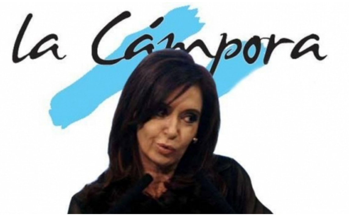
Figure 2: President Fernández de Kirchner speaks in front of a La Cámpora banner

Let us retake the banners of struggle of our people throughout history: human rights, the creation of the Great Country of Latin America, industrial sovereignty, the force of organized workers and social justice. But above all else, politics as a tool of all people for social transformation.<sup>4</sup>