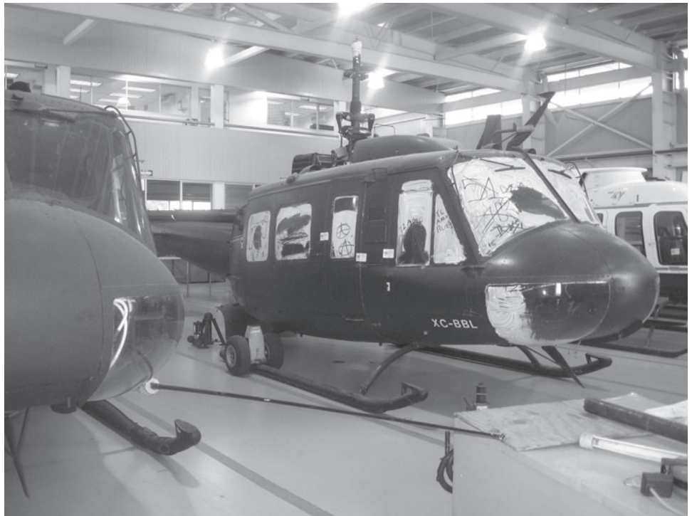
Figure 3: Mexican UH-1H Helicopter