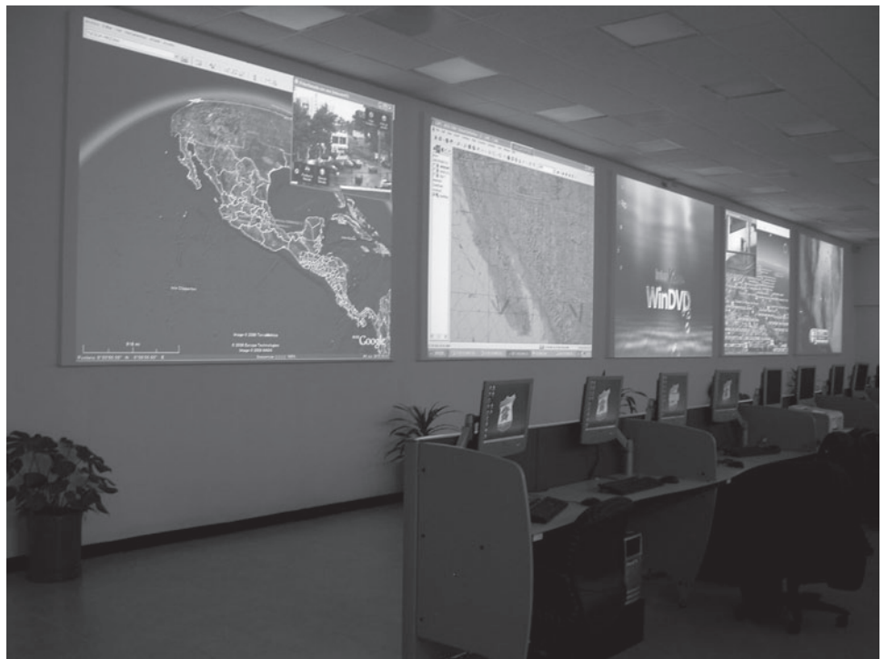
Figure 2: AFI Interdiction Center, Mexico City

acquisitions included computer servers, telecommunications data processing hardware and software, systems for encrypting telecommunications, telephone systems, motorcycles, and a decontamination vehicle for dismantling methamphetamine processing labs. In addition, NAS funded the renovation of a building where AFI staff were located, as well as the construction of a state-of-the-art network for tracking and interdicting drug trafficking aircraft (see fig. 2). According to State reports, since 2001, AFI personnel have figured prominently in investigations, resulting in the arrests of numerous drug traffickers and corrupt officials, becoming the centerpiece of Fox administration efforts to transform Mexican federal law enforcement entities into effective institutions.