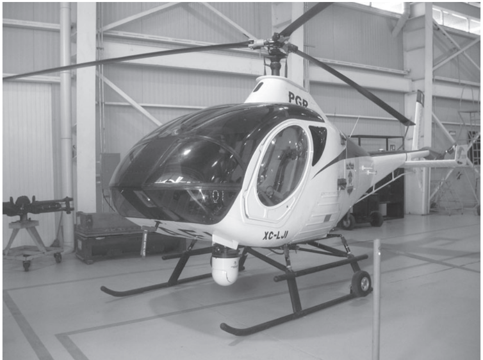
Figure 4: Mexican Schweizer 333 Helicopter